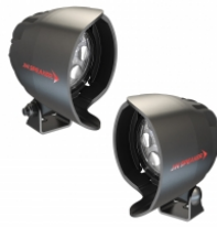
Part Number 0551753

12-24V LED Work Light with Spot Pattern & Side View Mirror Mount - 2 Light Kit