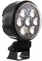
Part Number 0549841

12-24V LED Work Light with Trapezoid Pattern