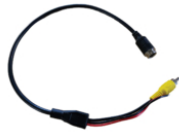
Part Number 3271571 M12-RCA CONVERSION CABLE