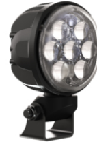
Part Number 0554201

12-24V LED Work Light with Spot Pattern & Side View Mirror Mount - 2 Light Kit