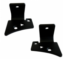
Part Number 6149233 A-Pillar Mounting Kit for Jeep TJ