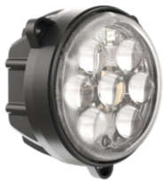
Part Number 0555461

12-24V LED Work Light with Spot Pattern & Panel Mount