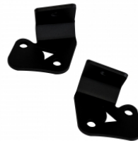
Part Number 6149203 A-Pillar Mounting Kit for Jeep JK