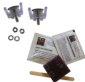
Part Number 8200491 Mounting Kit For Work Lights