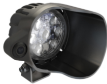
Part Number 0559913

12-24V LED Work Light with Flood Pattern & Panel Mount