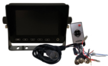
Part Number 6600801 COLOR MONITOR, 5", M12