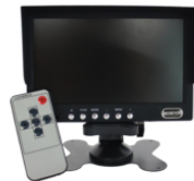
Part Number 6600841

Model 4415 Mirror Mount LED Work Light with Camera